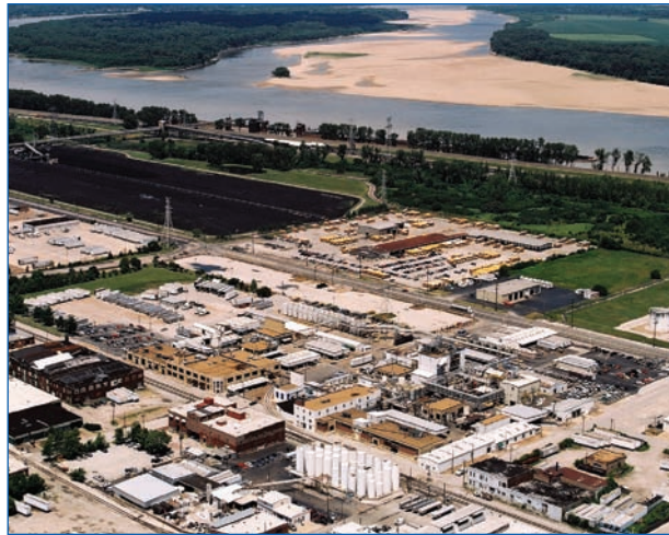
ELANTAS PDG, Inc. headquarters in St. Louis, Missouri

ELANTAS Electrical Insulation companies are strategically located throughout the world to meet the primary insulation, secondary insulation and electronic and engineering materials needs of our customers.